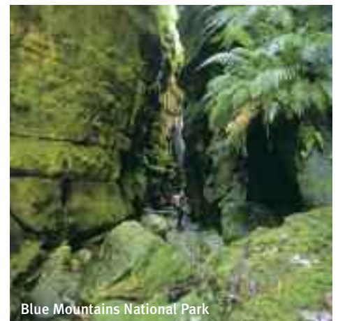
Blue Mountains National Park