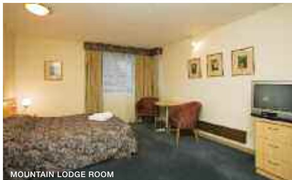
MOUNTAIN LODGE ROOM